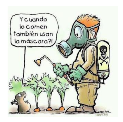
And when you eat do you also use the mask?